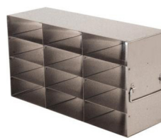
Racks (Crystal Tech)

We can help simplify your supply chain. Ask about Thomas Inventory Management Solutions .