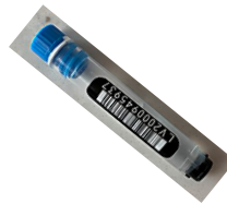
Extractionless Kits (labForce)

Interested in adopting an extraction-free workflow? Contact your rep to find out how.