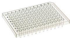
PCR Plates (labForce)

We offer a broad selection of amplification products including PCR plates, dNTP, Mastermixes, TAQ, and more. Microcentrifuges, shakers, incubators, and other instruments are also available from top suppliers like Benchmark Scientific .