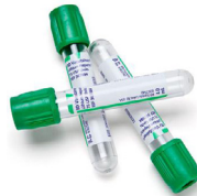
Blood Collection (BD)