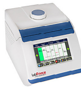
Thermal Cyclers (labForce)

A variety of detection kits are also available from top manufacturers including Agilent Genomics .