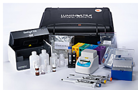
Wastewater Testing (Hach)