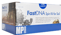
Spin Column Kits (MP Bio)