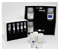
Single Tube Kits (MicroGEM)