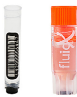
Tubes and Vials (LVL/Azenta)