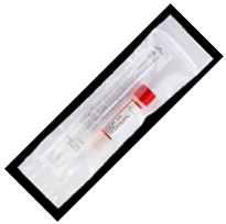
Transport Media (Copan)

Turn to Thomas Scientific for reliable sourcing of tubes, vials, saline, specimen bags, all swab types, and many other sample collection supplies. We also offer a wide variety of transport media products (VTM, MTM, and more) both in bulk and as pre-packaged solutions.