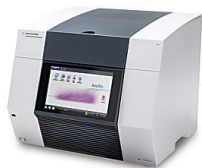
qPCR Instruments (Agilent)

Our expansive offering of thermal cyclers, plate readers, and other associated products will allow you to isolate and detect in your PCR workflow with the utmost confidence. We have partnerships with top global suppliers including Agilent Genomics , Hach , Omega Bio-tek and many more.