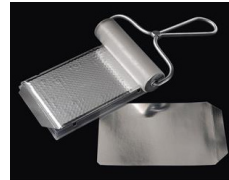
Sealing Film (Excel Scientific)

Custom kitting is also available! Click here for a free sample collection discovery session for your lab.