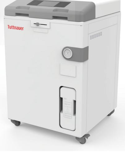
LabSci 85LV, 85 Liters