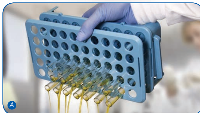
Both racks feature rubber grips that hold tubes securely in place when decanting liquids.