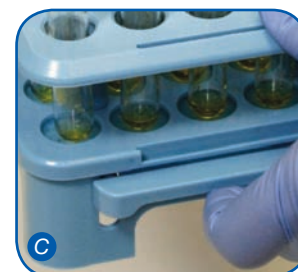
Items 456925 & 456926 feature a unique tube ejector for easy disposal of tubes.

Thomas Scientific We Believe You Are Important — How Can We Help?