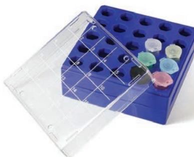
111599B (blue) 25-place box for 5mL macrocentrifuge tubes. Also available in red and yellow.