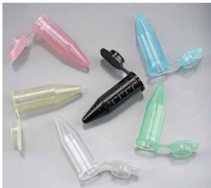
5mL snap cap macrocentrifuge tube colors (amber not shown)