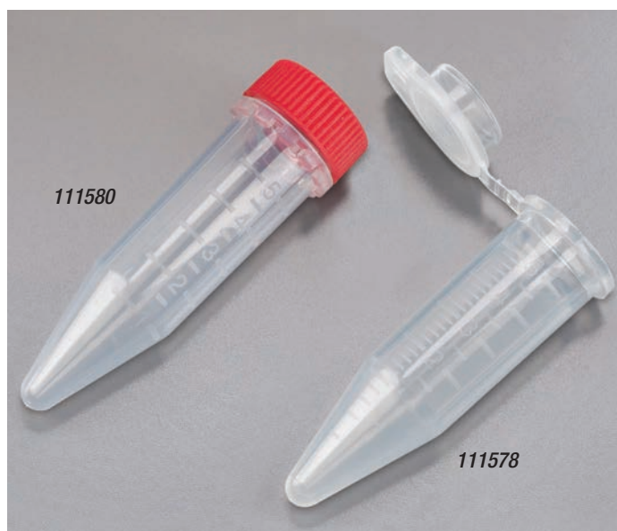
Tubes shown actual size