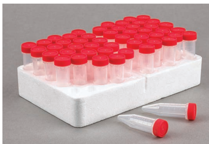
111580RS — Sterile in foam rack