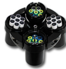
Blood Tube Pkg.