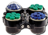
Tissue Culture Pkg.