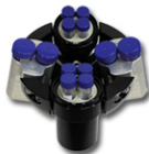
Tissue Culture Pkg.