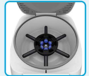
Includes 6-place Swing-out rotor!