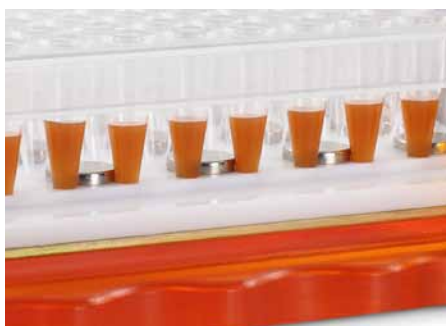
Figure 2: Separation of magnetic beads in microplate format

Note: PCR microplates have narrow wells, which increases surface tension and makes removing the excess fluid of the original sample from the beads difficult. For such microplates the use of a pipettor is recommended to fully remove the supernatant. In order to ensure efficient separation, make sure no air bubbles are formed during pipetting.