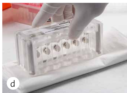
Figure 4: Separation of magnetic beads in tube format