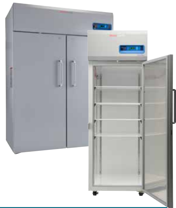
TSX Series high-performance auto defrost -30^{\circ}\text{C} freezers