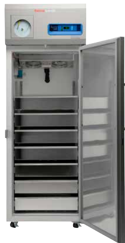
TSX Series high-performance -30°C plasma freezer