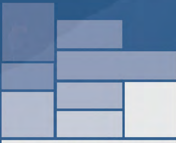
VMI vs. Consignment

VMI is a program where the vendor manages the level of inventory at the customer's inventory locations. The vendor is responsible for analyzing and optimizing the inventory flow for each of the customers they are in a VMI relationship with.