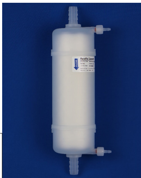
SKV Series Capsule with 1/2" Hose Barb Inlet and Outlet Connection