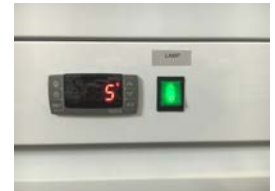
Digital Temp Display/ Microprocessor Temp Controller