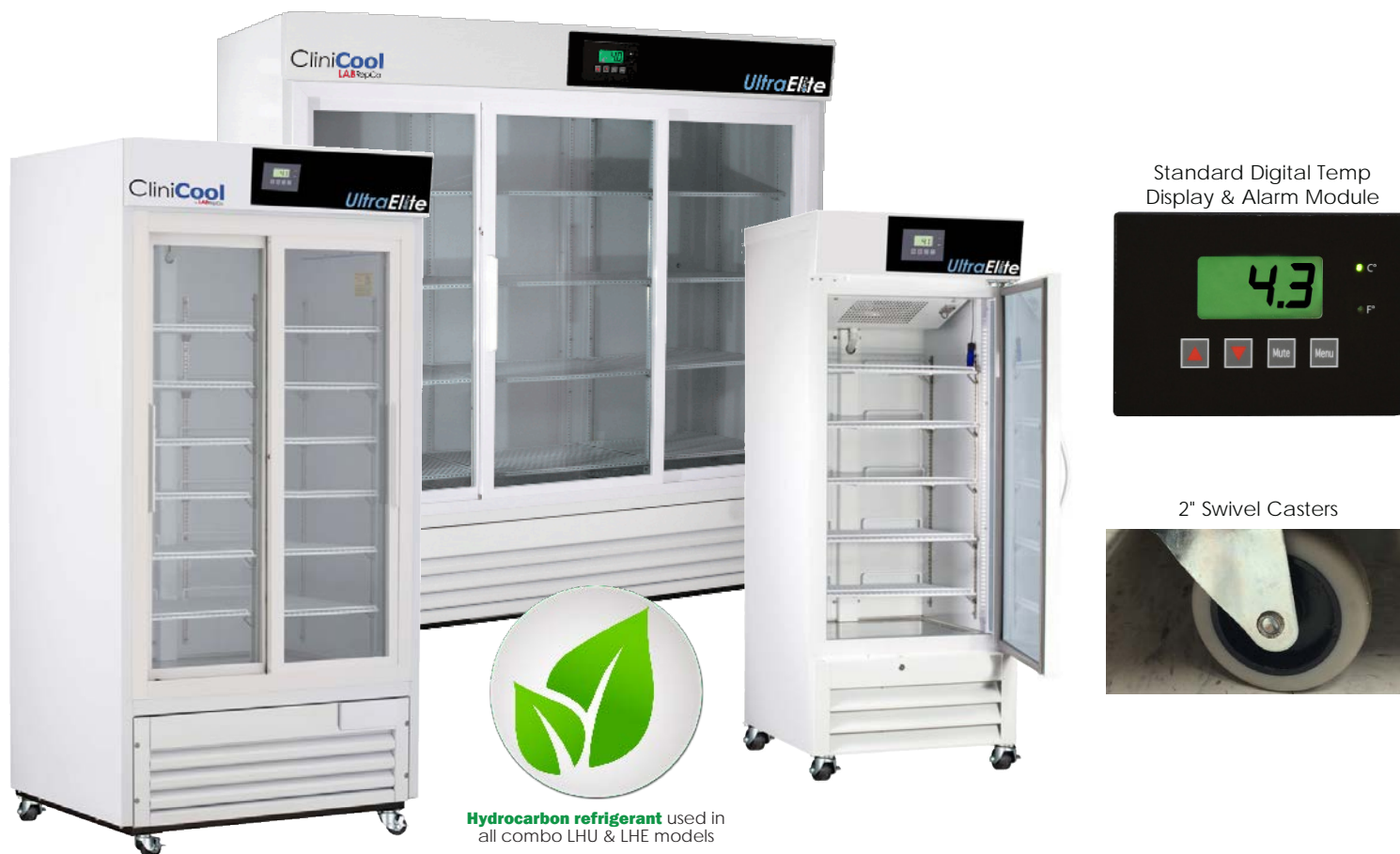
Standard Digital Temp Display & Alarm Module

Specifications subject to change without notice.