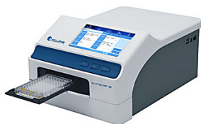
Microplate Readers (Benchmark)