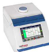
Thermal Cyclers (labForce)

A variety of detection kits are also available from top manufacturers including Agilent Genomics .