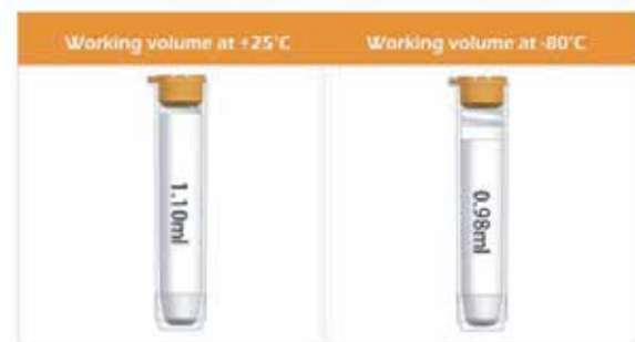
Working volume is 0.98 ml or larger depending on temperature.