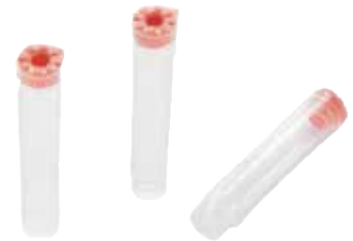
The 1.0 ml tubes with internal thread can be sealed with TPE caps 96-format.