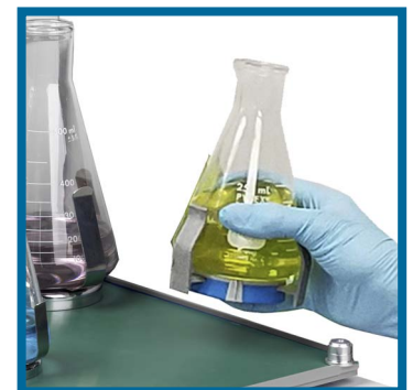
MAGic Clamp Platform H1000-MR with Adjustable MAGIC Clamp (H1000-MR-CMB)