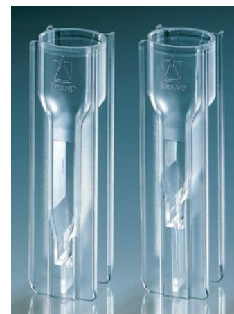
BRAND ultra-micro UV-Cuvettes. 8.5mm (left) and 15mm (right) window heights

Not sure of the beam height of your instrument? Check our website at www.brandtech.com/beam_heights.asp for help with cuvette selection.