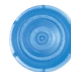
Round polyethylene caps provide plug-seal for reliable sample storage. Available in 4 colors!