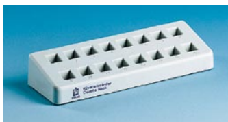
Polypropylene cuvette rack with 16 numbered positions. Autoclavable to 121°C (250°F)