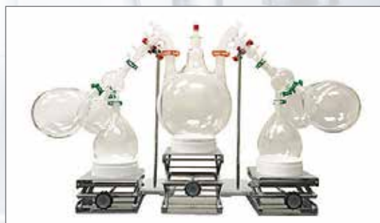
Thomas No.1139C58 Short Path Distillation Kit