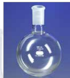
Thomas No.1234D50 Common Purchase Boiling Flask