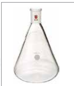
Thomas No.1198V25 SYNTHWARE Erlenmeyer Flask