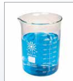
Thomas No. 1160X05 Glass Beaker Heavy Duty