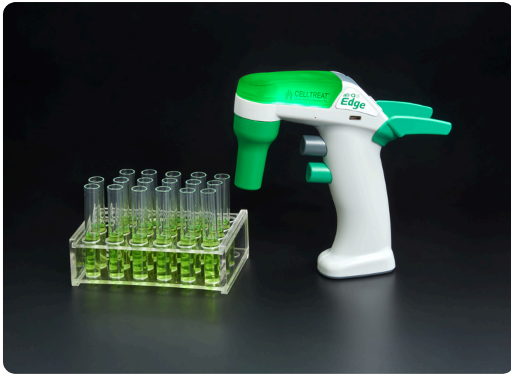
Unmatched aliquoting speed and accuracy with just the push of a button