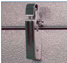
Spring actuated door closer

Uniformity and variation information is based on ambient conditions of 23^{\circ}\text{C} and 50% RH and they will vary more if the ambient conditions change on freezers during defrost periods and if there is interference to the airflow caused by product or other changes.