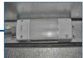
LED interior lighting