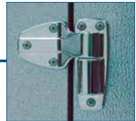
Adjustable door hinges