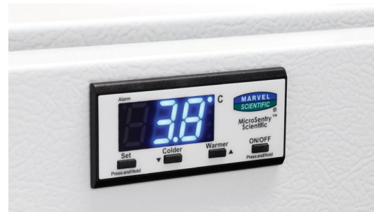
Door-front mounted temperature display and user interface