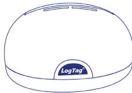
LTI-HID Not Included