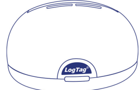
LTI-WiFi Not Included