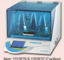
Item: 1213F79 & 1203F37 (Cooling)