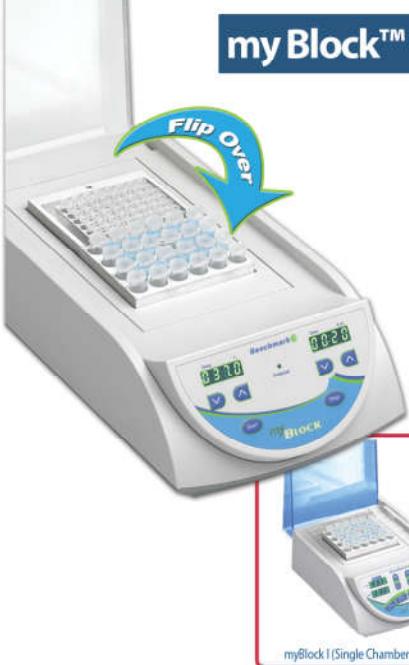
myBlock I (Single Chamber Dry Bath)