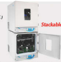
Item: 23A00W808 & 23A00W810 (Cooling)