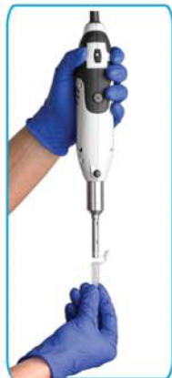
Ergonomic, "Slim-line" handle design