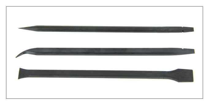
MPT123 Kit of MPT1R, MPT2, MPT3

Squared body - Curved fine tip and flat strong tip Lenght: 150 mm, 5.90"