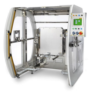
Corning Automated Manipulator Platform for automating the handling of multiple HYPERStack cell culture vessels