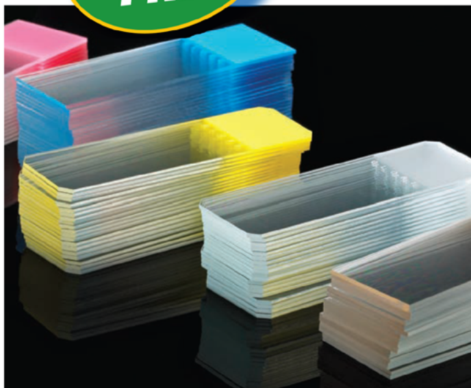
COLOR CODED SLIDES