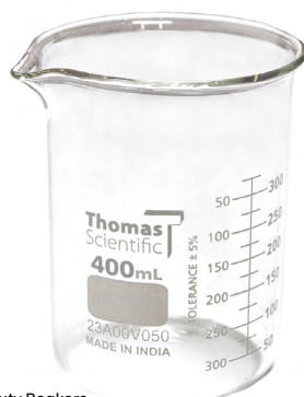
Heavy Duty Beakers