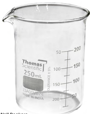
Standard Wall Beakers