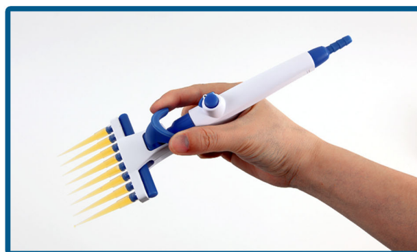
Shown with 8 Channel Pipette Tip Adapter (V0020-8)