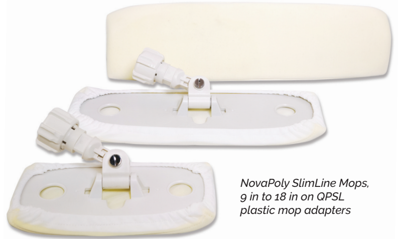
NovaPoly SlimLine Mops, 9 in to 18 in on QPSL plastic mop adapters

The Micronova SlimLine™ flat head mop cover is made of 100% NovaPoly™, smooth polyester with interior foam. This elasticized mop cover easily fits onto a 360 swivel SlimLine mop adapter available in plastic (QPSL) or stainless steel (QDSL) options for effective cleaning and sanitization in the cleanroom and equipment surfaces in Iso 5 to 9 areas. Mop covers are available in three different lengths. A SlimLine slip cover is available without foam for single use applications.