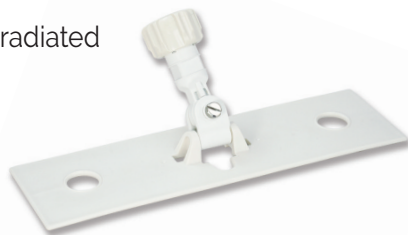
Plastic SlimLine Mop Adapter (QPSL)