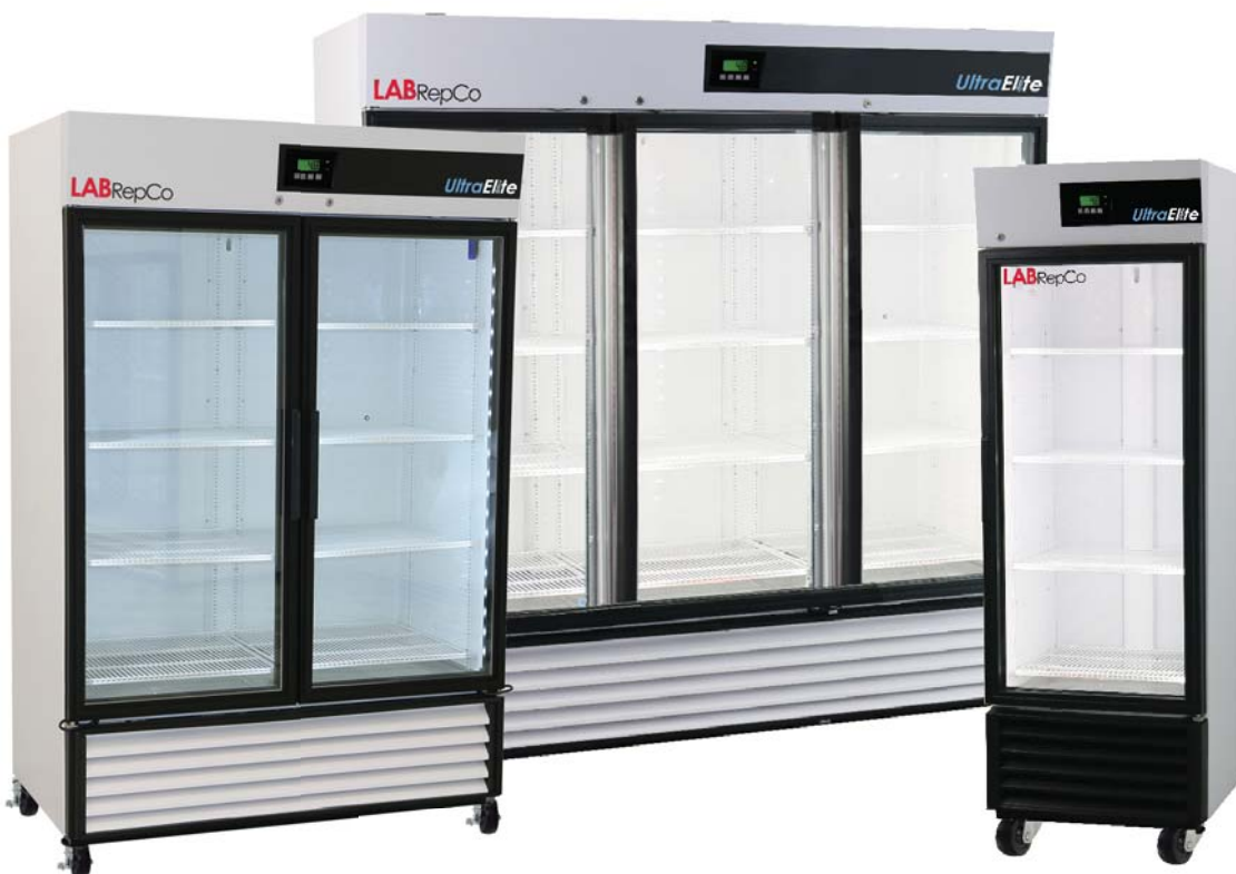
Standard Digital Temp Display & Alarm Module