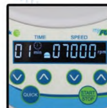
Digital display and control