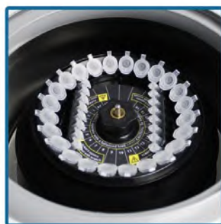
Included Combi-Rotor™ Accepts tubes and strips (includes snap on lid)