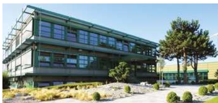
KNF Neuberger GmbH, Germany