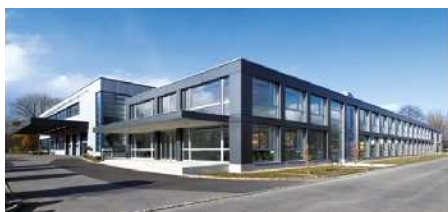
KNF Flodos AG, Switzerland