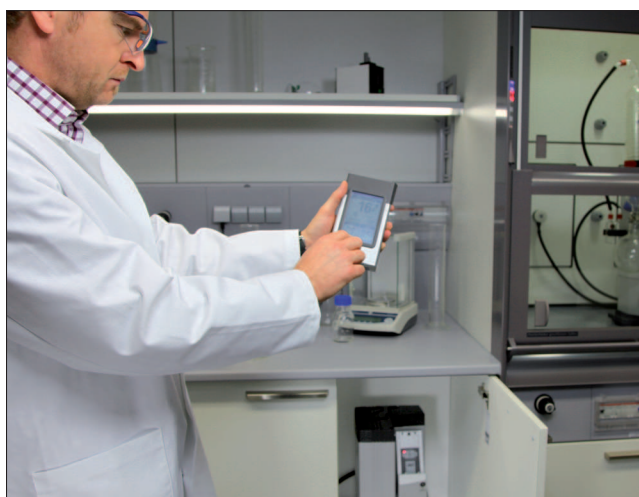
The mobile hand terminal (wireless remote control) thus ensuring maximum flexibility in the laboratory.