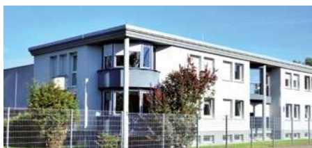
KNF Neuberger SAS, France