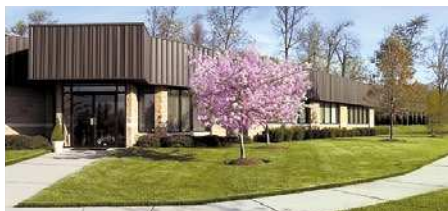
KNF Neuberger, Inc., USA