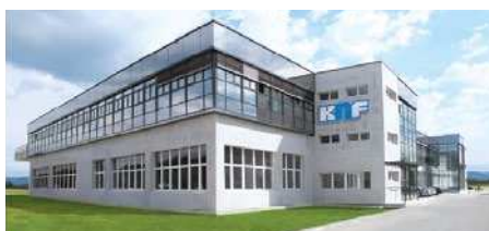
KNF Micro AG, Switzerland