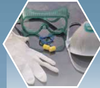
Laboratory Safety and Apparel