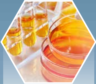
Lab Supplies and Consumables