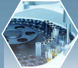
Equipment and Instruments