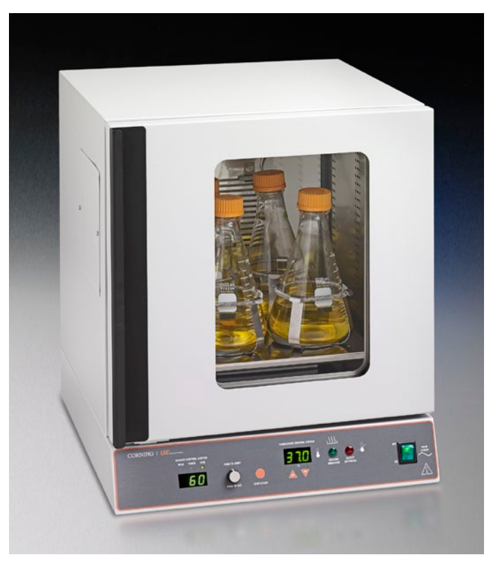
Corning LSE 49L and 71L Shaking Incubators (49L shown)