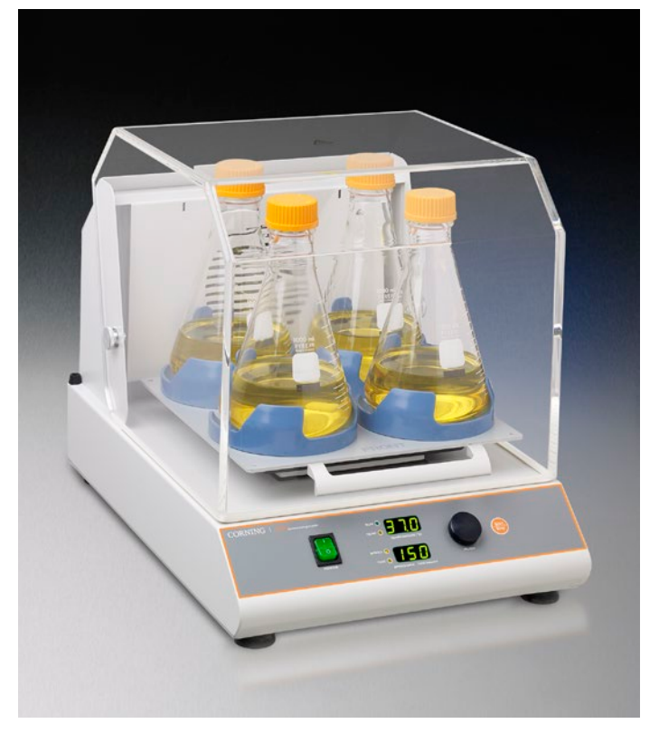
Corning LSE Benchtop Shaking Incubator

Corning LSE Shaking Incubators are the ideal solution to meet your small batch incubator needs. Whether performing bacterial research, microbiology, insect studies, yeast cultures, egg incubation, or any number of other applications, the shaking incubators from Corning provide a safe and convenient format for incubating your precious samples. Each model features an integrated orbital shaker designed into a compact footprint maximizing laboratory space. Additionally, a wide range of platform accessories are available to accommodate Corning glass and plastics consumables.