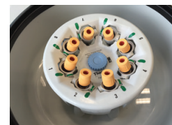
DualSpin rotor with swinging buckets