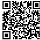
Glassware Washer Brochure