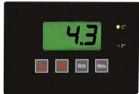
Digital Temperature Display and Alarm Module