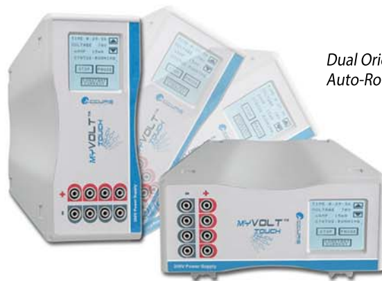
Dual Orientation, Auto-Rotating Display