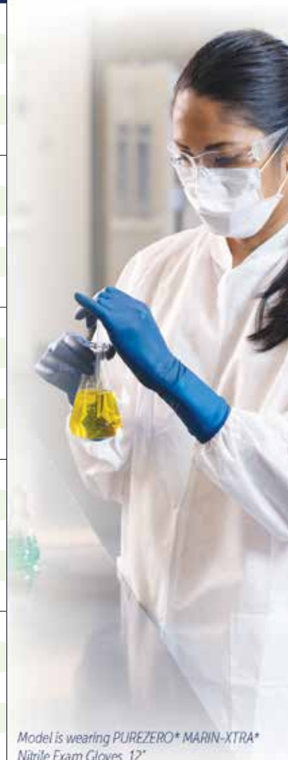
Model is wearing PUREZERO* MARIN-XTRA* Nitrile Exam Gloves, 12"

**Each offer is a volume discount offer consistent with the requirements of safe harbor provisions at 42 C.F.R. 1001.952(h) such that for example, "Buy 7 Get 3 means buy 10 at the same list price as 7 boxes of gloves." Customer must enter a Qty of 10 or 1 Case of the same Thomas No. in their cart and enter the promo code 0923 during checkout, to receive the price savings. Offer valid on qualifying purchases made from 10/1/23 – 3/31/24. Free goods shipped with order. No mix and match of skus or sizes allowed. New customers only. No prior Life Science sales.