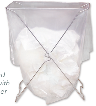
(Right) Scissor stand BLSSH-40 with 40x48 in liner