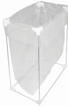
(Left) Rectangular Stand BLSSH-1624 with 40x48 in liner

The unique rectangular stand features polypropylene corner molds that connect the sides and function as the stand base. The base reduces the possibility of rusting directly on the floor surface and slides easily to help prevent scratching. Optional casters can be added for ease of mobility when relocating the bin stand. The scissor stand folds open and closes for storage when not in use.