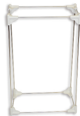
Rectangular Stand BLSSH-1624

Manufactured for use in Controlled Environments • ISO 5 thru 9 Cleanrooms • ISO 9001 Certified Manufacturing Facility