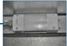
LED interior lighting