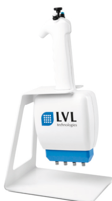
4-channel semi-automatic capper Thomas No. 22A00B335

SBS 96: RCK-CR96-P-L SBS 48: RCK-CR48-P-L SBS 24: RCK-CR24-P-L