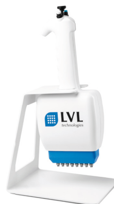
8-channel semi-automatic capper Thomas No. 22A00D673