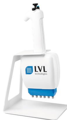
6-channel semi-automatic capper Thomas No. 22A00H279