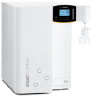
arium® comfort Series Combined pure and ultrapure water systems