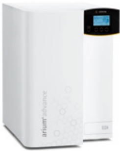
arium® advance Series Pure water systems