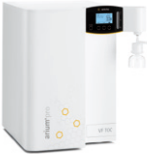
arium® pro Series Ultrapure water systems; any application-specific configuration can be selected.