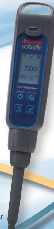
pH Spear Tester