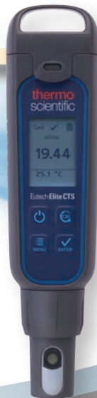
CTS Tester (Cup)