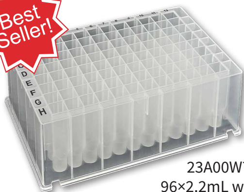
23A00W712 96×2.2mL wells

labForce® multiwell plates are fully compatible with KingFisher™ automation platforms, as well as Accuris IsoPure™. All four plates feature square wells with conical v-bottoms and printed alpha-numerics. They are available in sterile or non-sterile configurations.