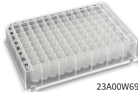
23A00W692 96×1.0mL wells