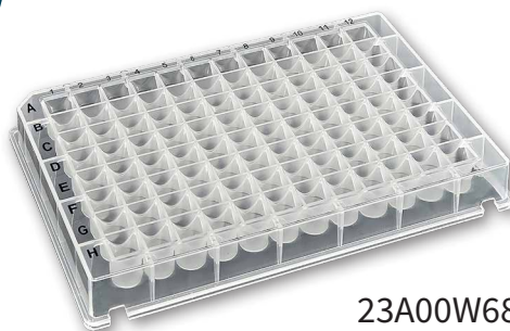
23A00W682 96×0.5mL wells