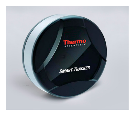
Smart Tracker wireless monitoring device