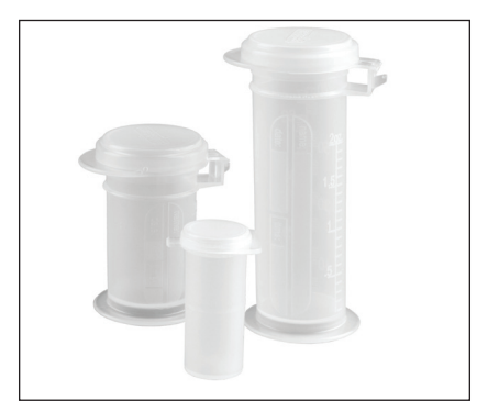
Capitol Vial Snappies™ Breast Milk Container System