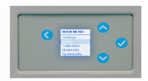
Clear intuitive displays for precise temperature control