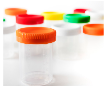
Thermo Scientific Samco Clicktainer Vials and specimen containers

Visit thermofisher.com for accessories, wireless monitoring, consumables, media, reagents and more.