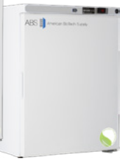
Part Number 1182V08