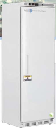
Part Number 1145Q18