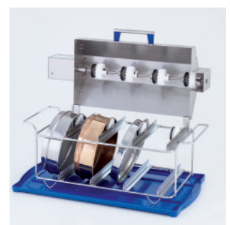
Sieve cleaning module placed onto plastic cover (Elmasonic 300) for drip-off