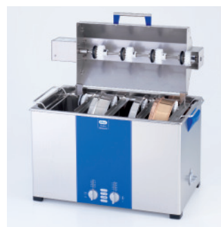
Sieve cleaning module inserted in ultrasonic unit