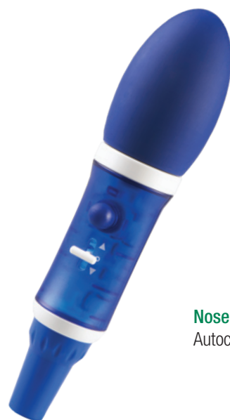
Nose Cone Autoclavable