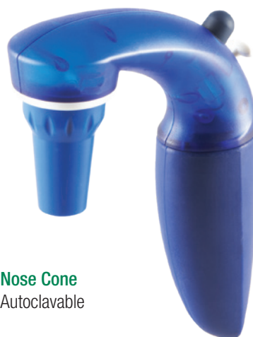
Nose Cone Autoclavable