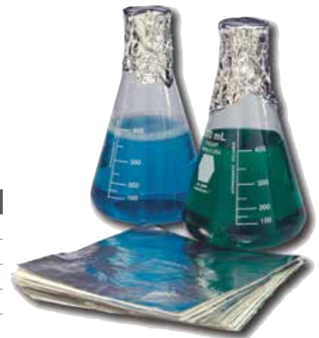
Continued on reverse side