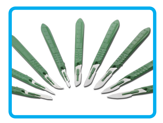
Sizes 10-25 available sterile