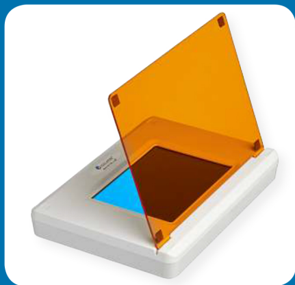
Amber cover raised for easy gel access

An array of super bright LEDs with a long, 30,000 hour service life provide the light source for the SmartBlue Transilluminator. Unlike those in a UV transilluminator, the filters in the SmartBlue will not solarize and degrade in performance over time. Gel bands can be excised directly on the scratch resistant, glass viewing surface. To save energy, the power switch includes an automatic 5 minute shutoff. The SmartBlue Transilluminator is covered by a 2 year warranty.