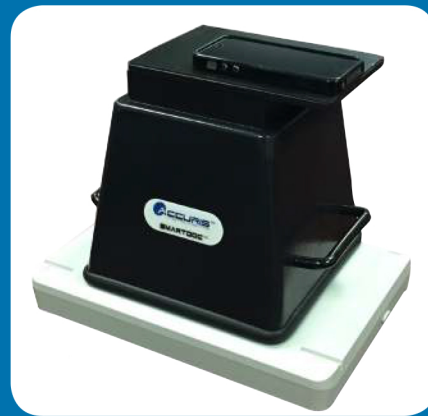
Use with SmartDoc™ for gel imaging with a cell phone